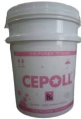
Cerium Based Polishing Powders